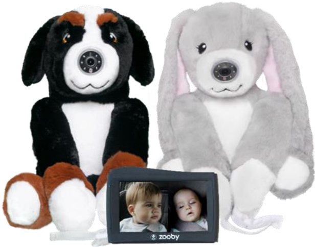
Recalled Zooby baby video monitors (Dog and Rabbit)