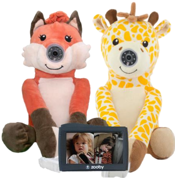
Recalled Zooby baby video monitors (Fox and Giraffe)